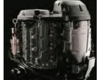
COMPACT V6 BLOCK