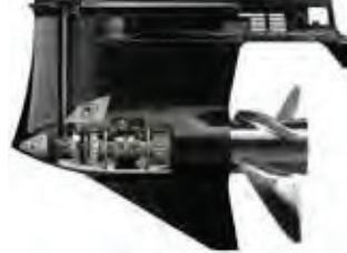
SUZUKI SELECTIVE ROTATION