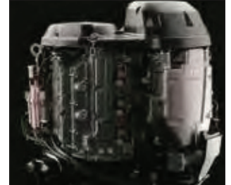
COMPACT V6 BLOCK