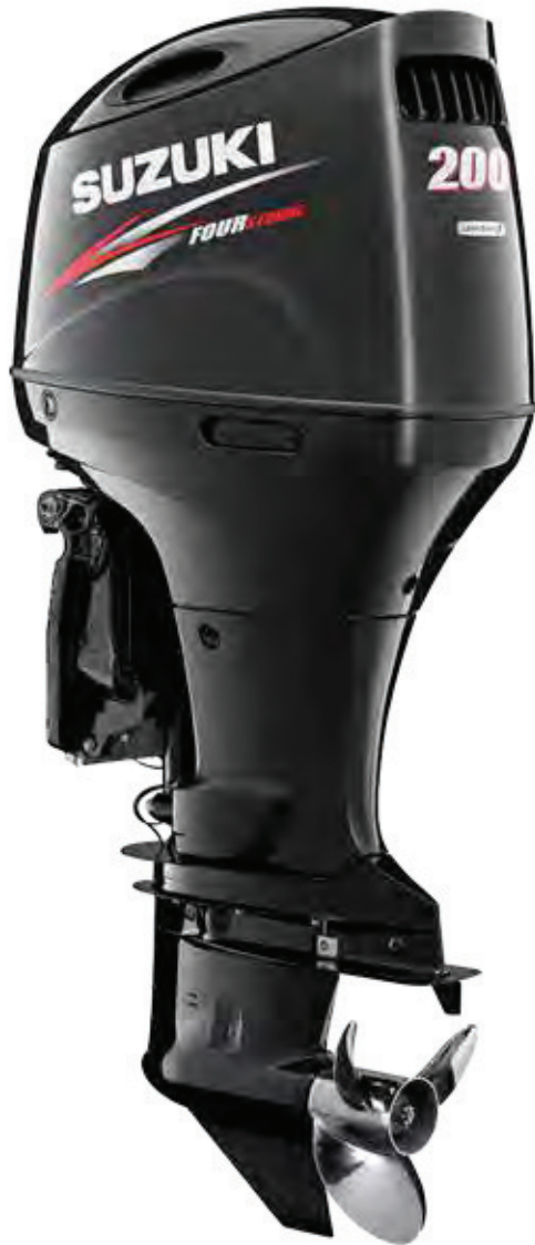
Comparison of Fuel Efficiency per Litre (New DF200A vs. V6 DF200)